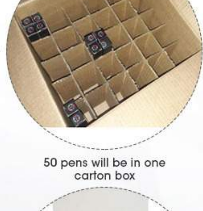
50 pens will be in one carton box