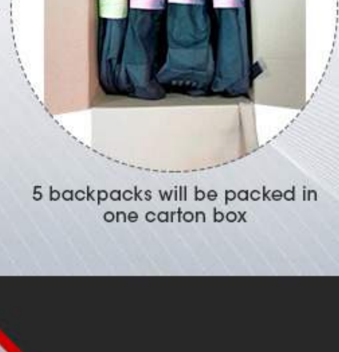
5 backpacks will be packed in one carton box