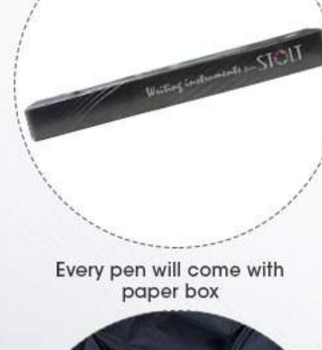
Every pen will come with paper box

High density foam with bushes to absorb all kinds of shock and vibrations