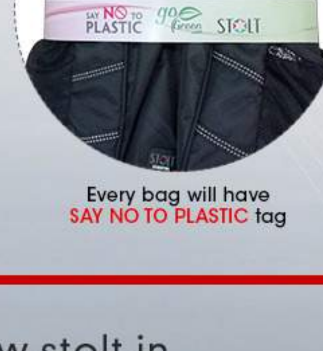
Every bag will have SAY NO TO PLASTIC tag